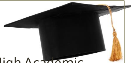
High Academic Standards