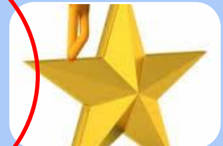
8. Valuing each person responsible for the education of our students