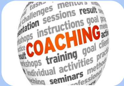
1. Professional Growth