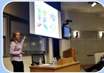
2. Physical Space and Technology Infrastructure