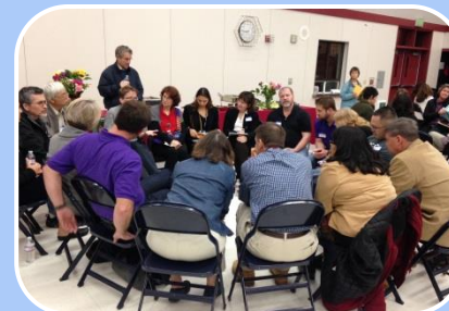
7. Parent Engagement