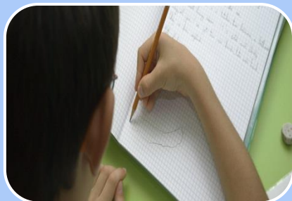
5. Progress and proficiency of English Learners