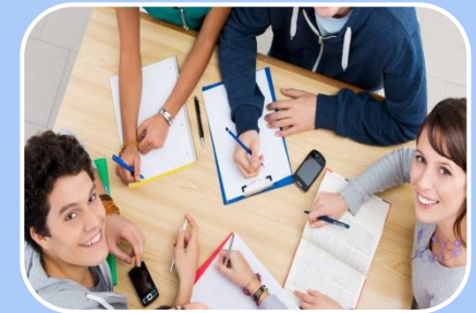
4. Student Goals (academic, social and personal)