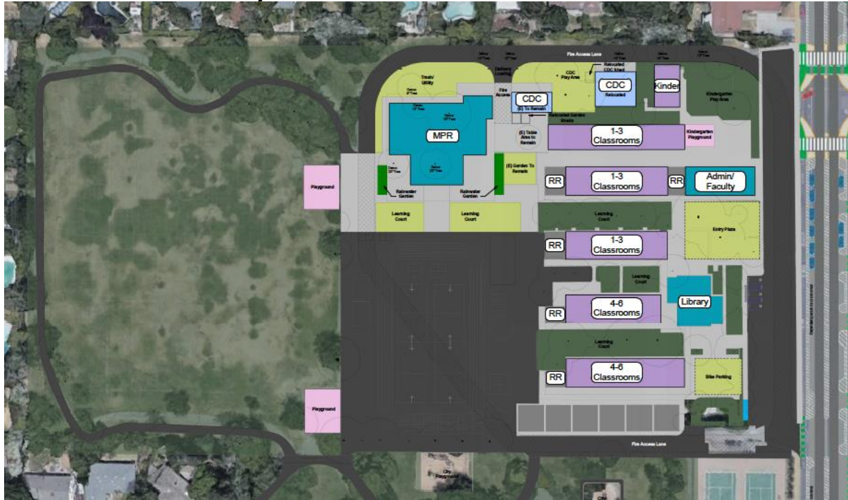
EXHIBIT B cont'd.