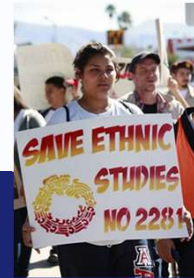
Ethnic Studies Courses (Tucson)