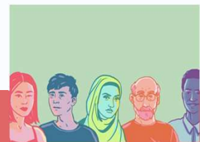
Ethnic Studies Model Curriculum