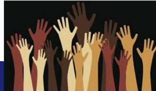
Multicultural Education Reform