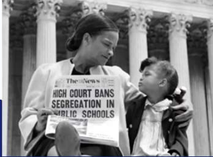
Brown vs. Board of Education